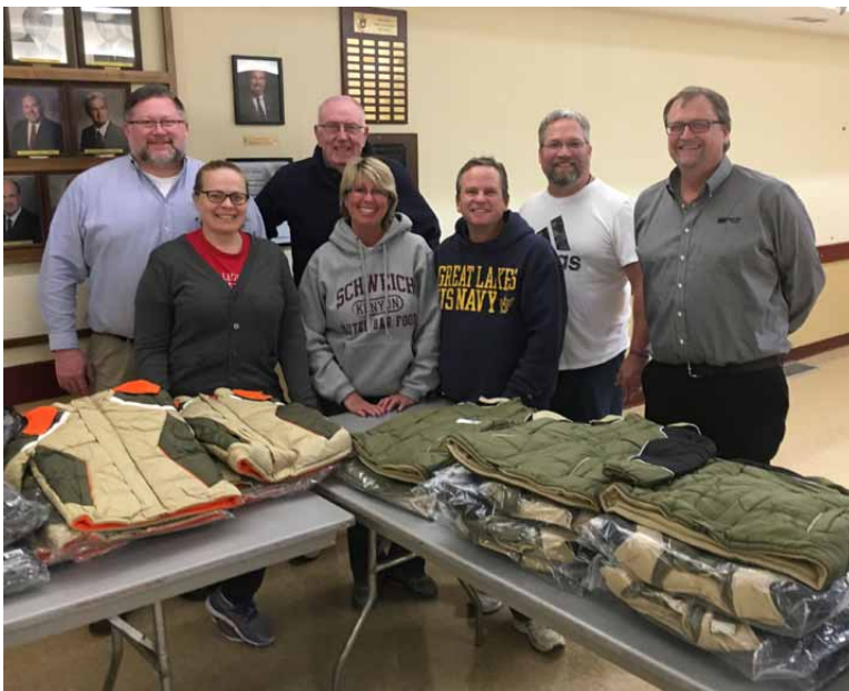
Pictured is the crew who distributed the "Coats for Kids" a Knights of Columbus initiative.

Through their "Coats for Kids" program, 1,780 local councils distributed 87,906 coats to children in need throughout the United States and Canada in 2016. Since the program began in 2009, nearly 400,000 coats have been distributed.