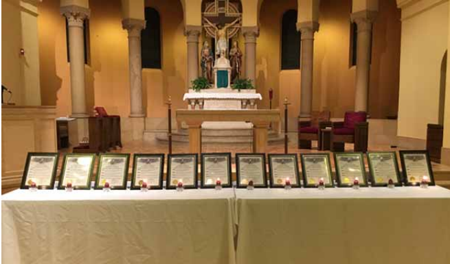
Certificates of remembrance were displayed in the sanctuary.

Following the Mass a time of fellowship was held with Brother Knights and family members of the deceased Brothers in Joseph Hall.