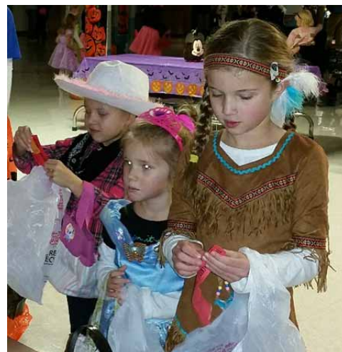
Having a few treats as they make their way around to all of the games and activities.