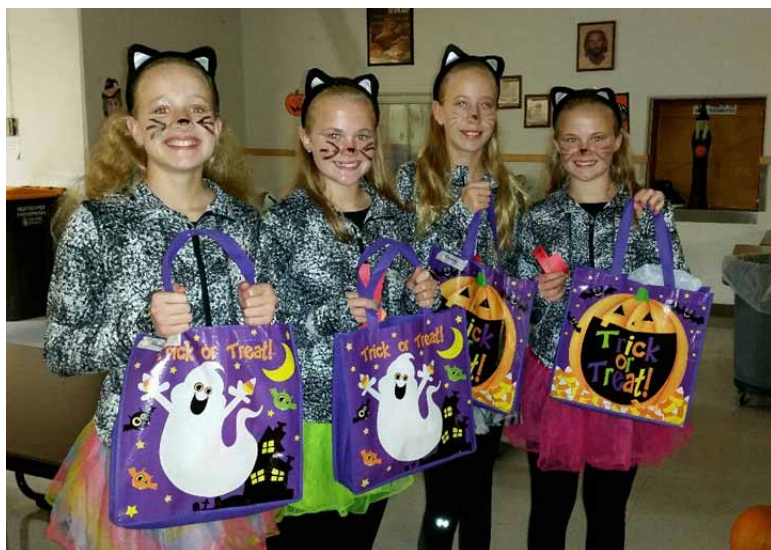
Great costumes for four of our Halloween guests.

The Council's annual children's Halloween party was a great success. Close to 325 children were in attendance. Thanks to Hy-Vee, Cashwise Foods, and Fareway Foods for donating the food and prizes. Thanks for the donation to the food shelf also, 393 pounds of food was collected. Also, thank you to the KC members and families, REP students, and St. Mary's students for volunteering their time at the Halloween party to make it a success. In addition, a big thanks to our Council sponsored Scout Troop #253 for their usual fine help.