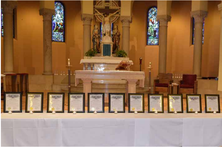
Certificates of remembrance were displayed in the sanctuary.