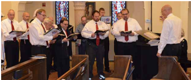
The KC Chorus provided inspirational music for the Memorial Mass.