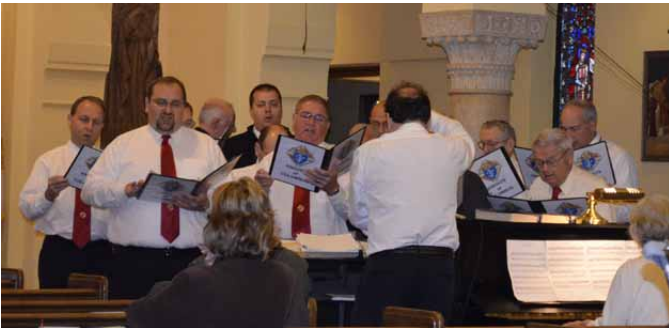
The KC Chorus provided inspirational music for the Memorial Mass.