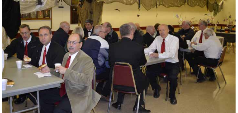
Refreshments were served at the KC Hall for participants and family members of the deceased Knights who were recognized at the Mass celebrated in their honor.