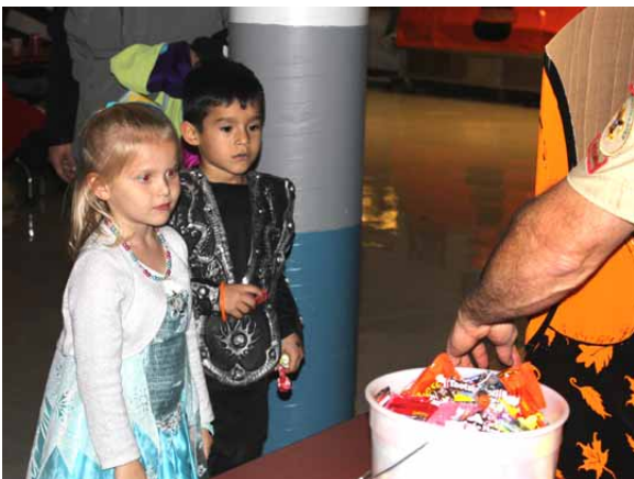
Two children anxiously wait for their Halloween treats.