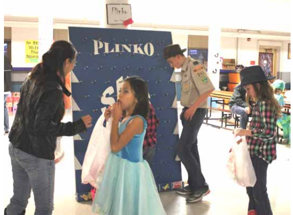
Plinko is one of the favorite games at the Halloween party.