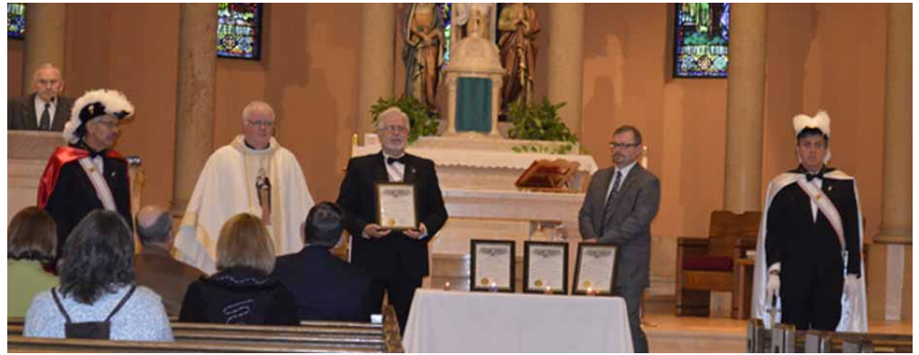
Certificates of remembrance were displayed in the sanctuary.

The following deceased Knights were honored: