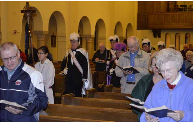
A Fourth Degree honor guard processed in at the beginning of Mass.