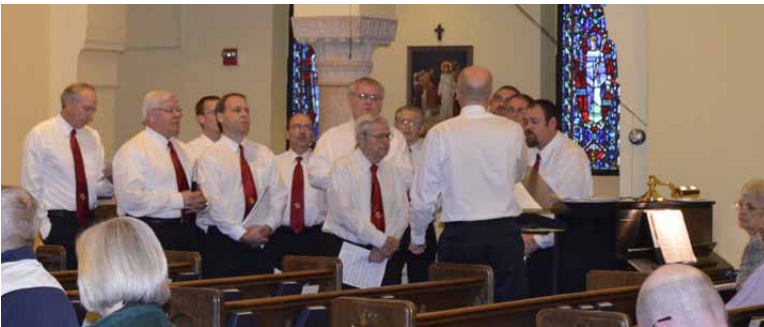
The KC Chorus provided inspirational music for the Memorial Mass.