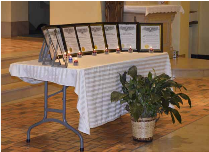
Certificates of remembrance were displayed in the sanctuary.