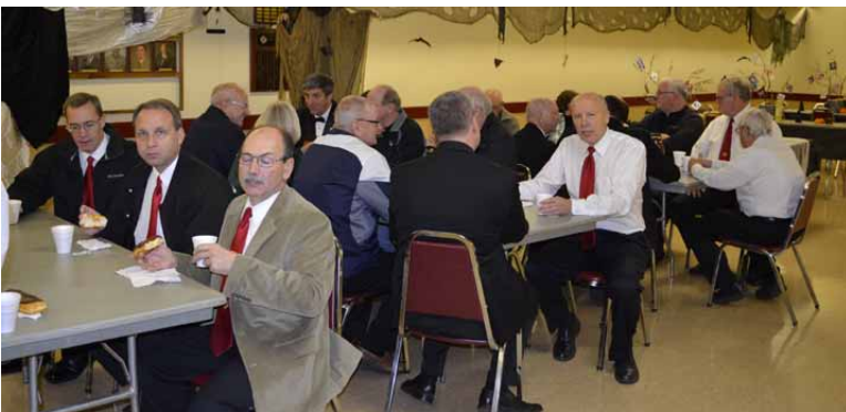
Refreshments were served at the KC Hall for participants and family members of the deceased Knights who were recognized at the Mass celebrated in their honor.

The following deceased Knights were honored: