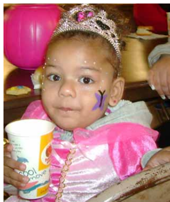
Little princess .... one of our younger attendees enjoys the McDonalds orange drink.