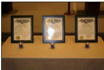
The Resolution of Respect were presented to the deceased members families at the conclusion of Mass.