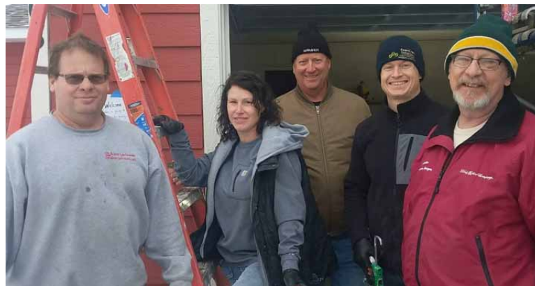
Knights of Columbus volunteers stop to have a picture taken.