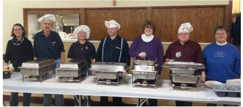
The fish dinner line prepared to serve the hungry patrons.