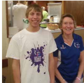
Relay For Life members work at the fish dinner.