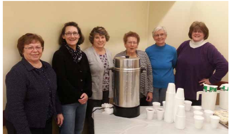
Owatonna Catholic Daughters provide service, milk, coffee, and help to whomever needs it.