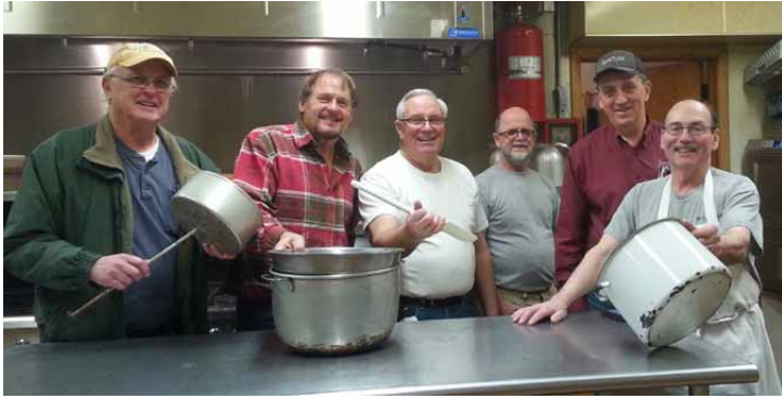
A smiling group of KC members prepare to get things going for the fish dinners.

The 2016 edition of the Lenten Fish dinners is in the books and it was a very successful project. The first one of the year started out with the Catholic Daughters and went very well for getting back into the swing of things. The second one was for St. Vincent de Paul which was a little smaller crowd, but went well. The February 26 dinner with Owatonna Council 945 & Relay for Life saw a total of 350 served. On March 4 we set a new 'walk-in' record with 155 and a total of 415 being served for the evening with the Medford Knights of Columbus and Catholic Daughters. On March 11, we served close to 500 meals with the Msgr. Henry Speck Fourth Degree Assembly and Grandparents for Education as beneficiaries. Birthright and Compassionate Friends sold over 200 tickets for the March 18 night, and with walk-ins, free kids, and workers, over 300 were served.