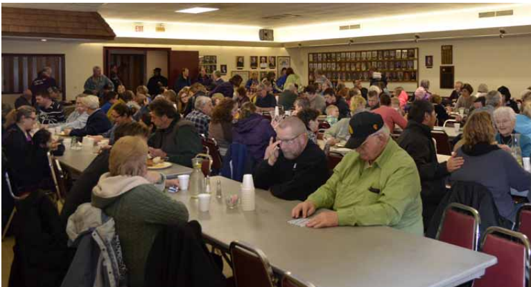
A huge crowd at one of the fish dinners.