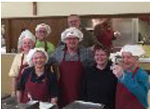
A group of KC members and friends prepare to serve a wonderful meal.

Fish Fries are going great – we served nearly 700 the first two Fridays. The meals are very good and you should plan on enjoying a couple during Lent. There are many good beneficiaries on the list again this year.