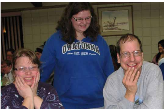
Some of the guests enjoying the evening playing bingo.