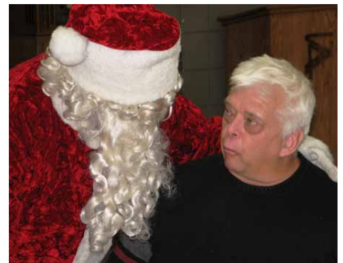
Santa listens for requests from one of the guests.