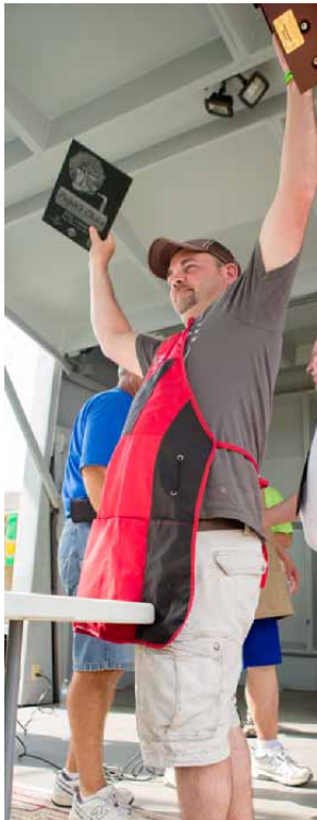
Backyard BBQ champion.