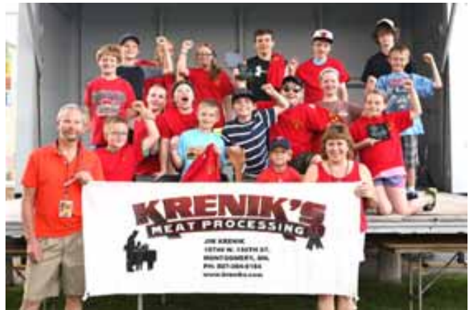
Kids Q contestants.