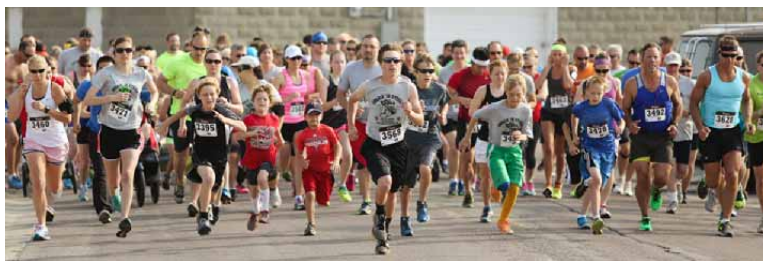
5K Run starts.