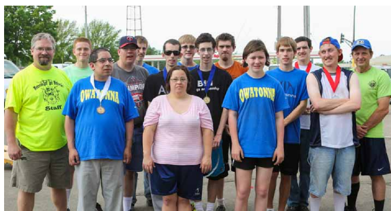
Special Olympic participants in the bean bag toss.