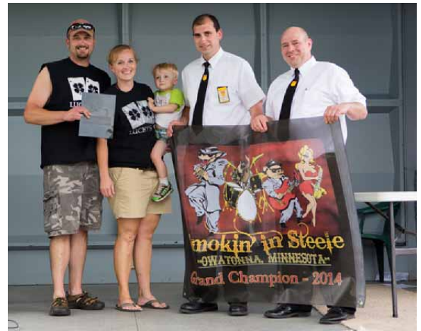
2014 Grand Champions