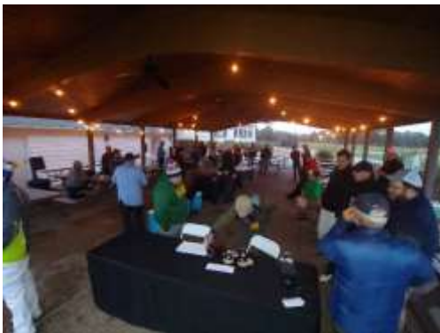
After Golf Outing Festivities