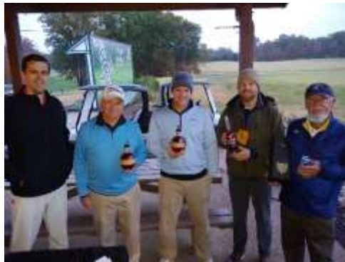
Gabe Jones and his Team