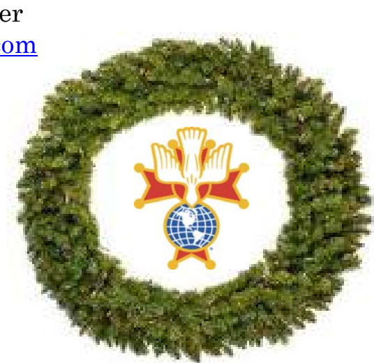
Page 17 of 17

Greg Lynch, PGK Knights of Columbus Faithful Captain 379 Warden to the Master glynch7612@gmail.com 410 596 5872