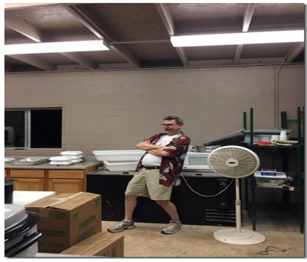
FIGURE 2 ANOTHER DISGRUNTLED SUPERVISOR!!