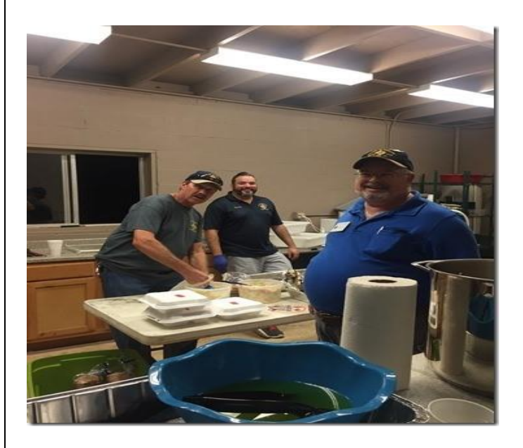
Bro. Knights hard at work during recent community roundup.