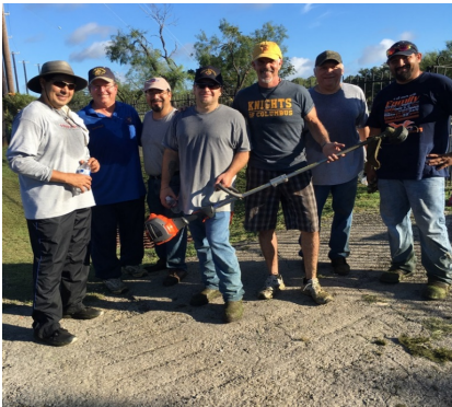
Knights cleaning up at the new property