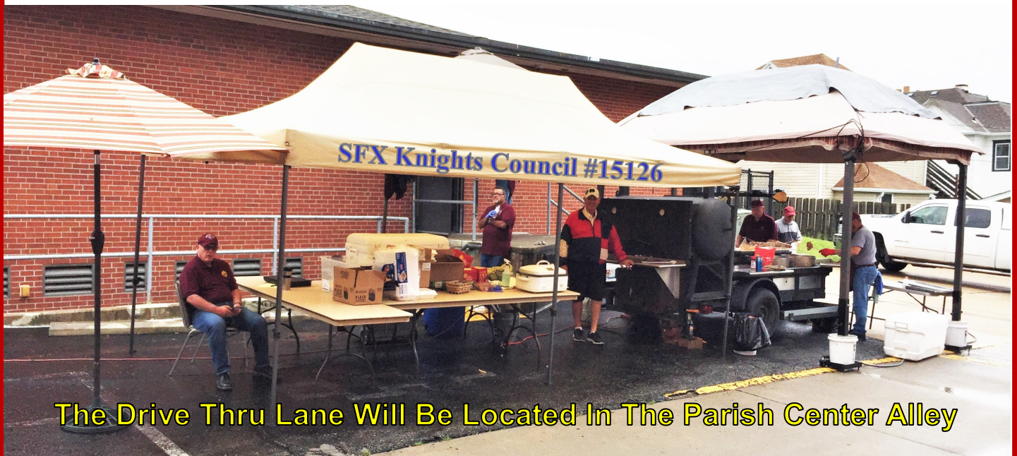
The Drive Thru Lane Will Be Located In The Parish Center Alley

St Francis Xavier K of C Council will sponsor the Annual SFX Parish Chicken Dinner to be held on Sunday Sep 19th and all member Knights will be called upon to volunteer their time and talents to make this event a culinary, social and financial success. Due to the lingering COVID-19 restrictions we have decided to offer “Drive Thru Only Service” for this dinner. Please plan to attend the Sep 7th Council Member Meeting so you can sign up to help out. This is a major Council fundraising event and there is great anticipation among our parishioners to get back to “normal” parish activities. Pictures of the setup for our last Chicken Dinner event are shown below.