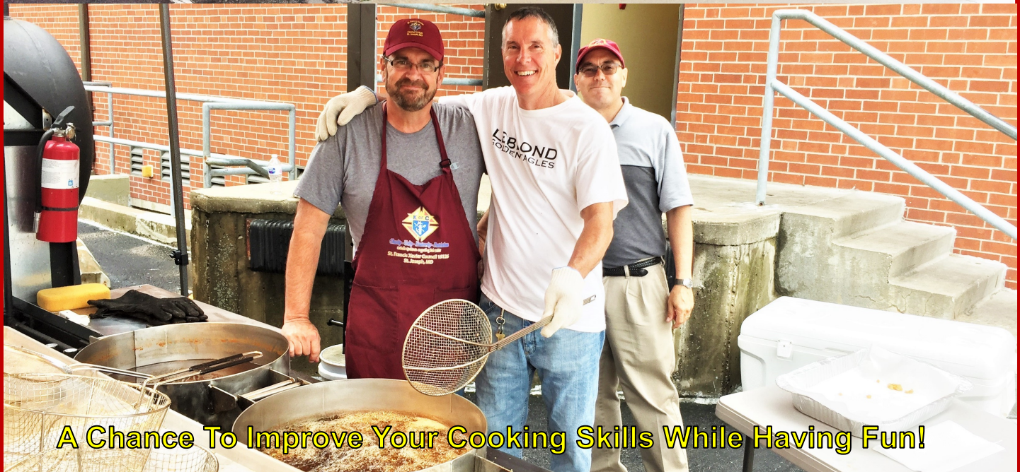
A Chance To Improve Your Cooking Skills While Having Fun!

On-Demand Exemplification of Charity, Unity and Fraternity — A Direct Link