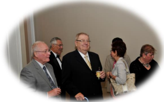
Socializing after the Installation of Officers