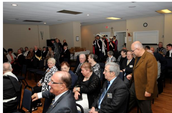
Colour Guard and other guests