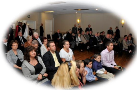
Family and Friends await start of Ceremony