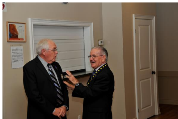
Discussing the evening activities