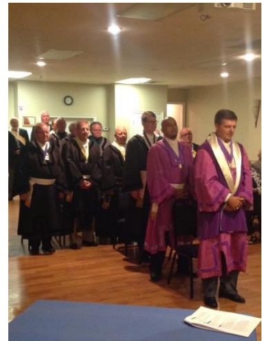
Our Officers 'form the cross' while in taking their positions following their respective installation