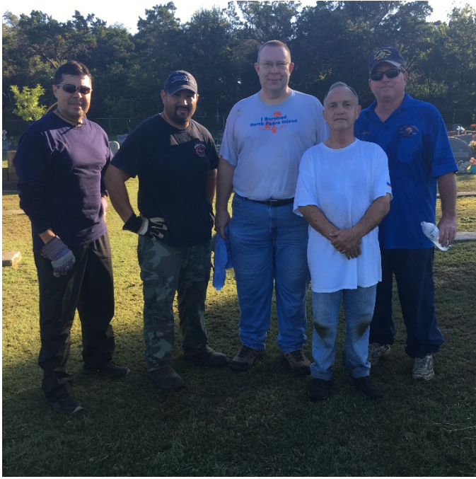
Brother Knights who cleaned-up the Cemetery On Sept 17th.