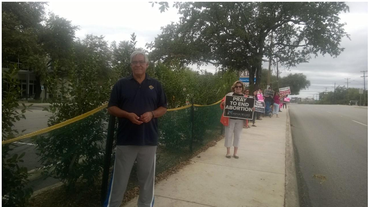
PGK/SK Ysau Flores