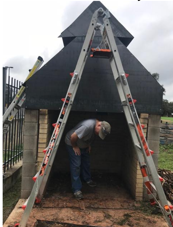
“Ducking to get into the BBQ Pit”