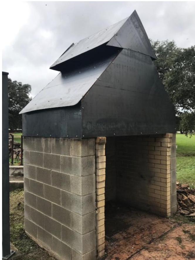
Roof Work Complete