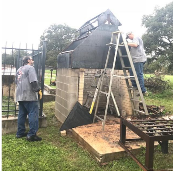
Roof Work in Process