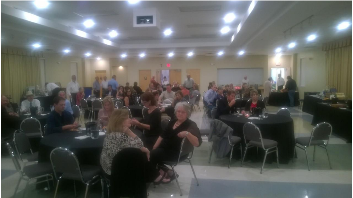
Wine tasting event prior to the entertainment and dance

As shown below, the wine tasting social that occurred on Saturday September 22 was not only a success in acquiring a profit of $4350 but as shown below, a lot of enjoyment.