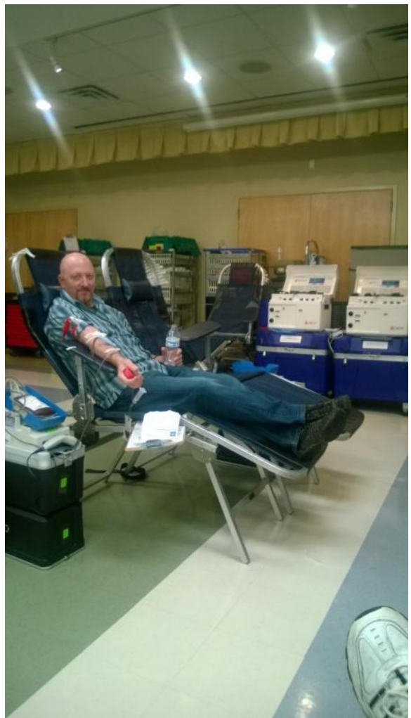
Sort of a Happy Face of Mark Kelly