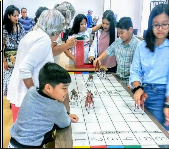
Bottom left is the popular cake walk and upper right was the very popular horse race. Almost as exciting as the Kentucky Derby!