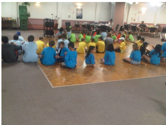
Attentive participants at the Bible Camp.