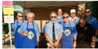
Members of the Three Councils in Burlington came out to BBQ for the event.