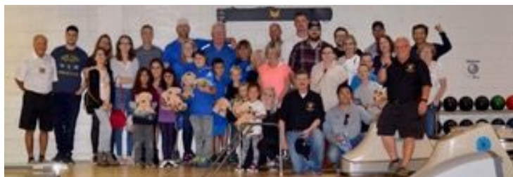
Participants of the Family Bowl for Charity Strike Out Cancer event.