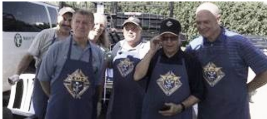
Brother Knights assisting at the celebration of the 40th Anniversary of the Centre on September 15.