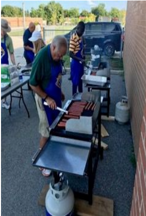
Brothers with volunteers working the barbecues.