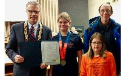
Mayor Rick Goldring reads a proclamation in council chambers about the Special Olympics Flag raising ceremony on March 7, at 10:30 a.m. at City Hall.