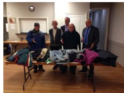
Knights donated 52 gently used coats to be distributed at the Clothing Exchange held at St. Christopher's Church on Guelph Line. It is our small acts of kindness that allow us to make a difference in our community.