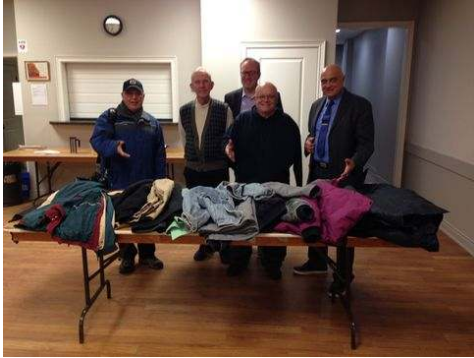
YOUTH ACTIVITIES COAT DRIVE On February 12, Council 5073 held its first annual coat drive. Gently used coats were collected.