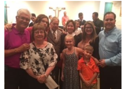
Knights from Council 5073 were invited to attend Graduation Liturgies to present Knights of Columbus awards to students at six Burlington Catholic Elementary Schools.