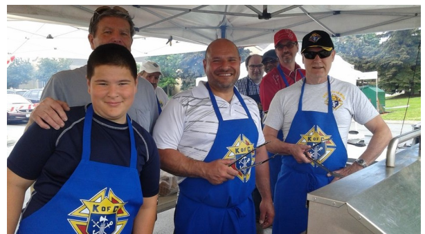
Once again, the Knights don their aprons to prepare food for the parishioners and guests on June 25!