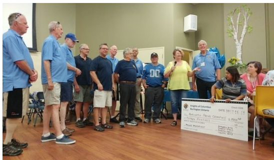
Scenes from the cheque presentation from three councils and the assembly in Burlington to Burlington Special Olympics for sponsorship. It was presented on June 16 at Special Olympics Spring Fling Dance.