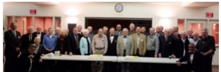
Members and wives from various parishes attended the Founder's Day Mass held at St. Raphael's Church in March.