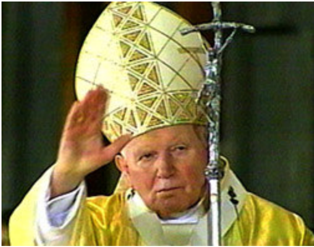
Pope John Paul II 1920-2005