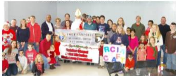
National Wreaths Across America Day