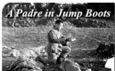
Known as the "Paratrooper Padre"