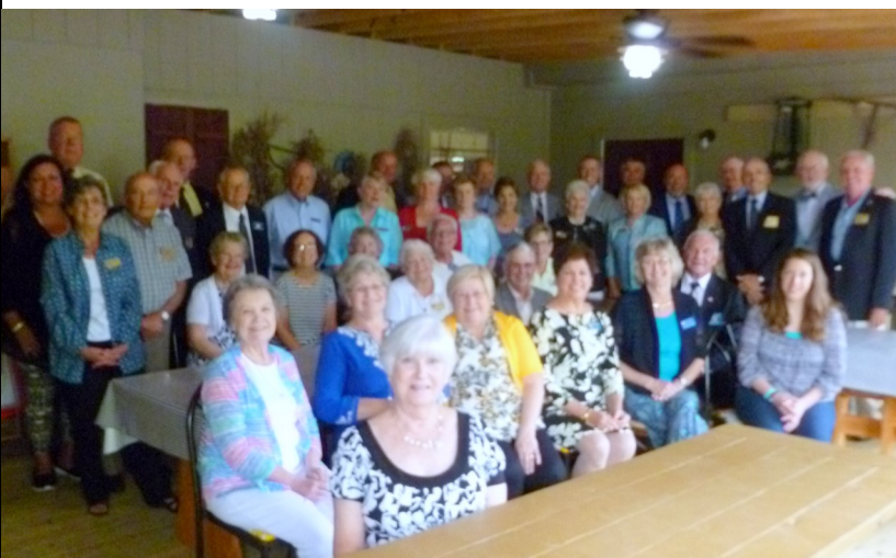
More than forty Knights, their spouses and parishioners enjoyed brunch at the Country Kinfolk Restaurant in Lenoir City following a quarterly Corporate Communion Mass at St. Thomas Church on Sunday, August 30.