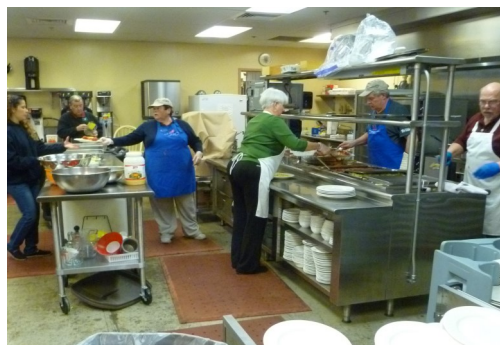
The Pasta Dinner kitchen crew prepare take-home and last minute meals.