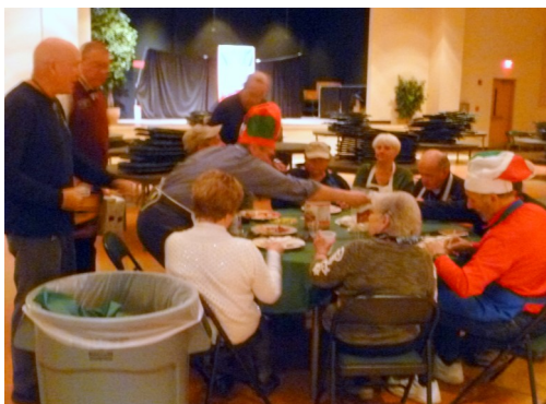
Dinner workers relax after the hall clean-up.