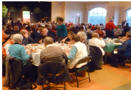
Every seat is full with satisfied pasta eaters.