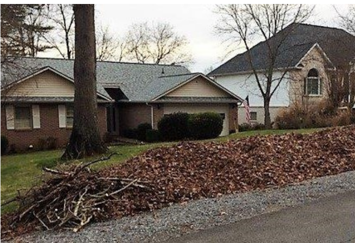
Raked leaves in front of the Burgett house.