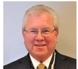
Blue Mass Event Coordinator