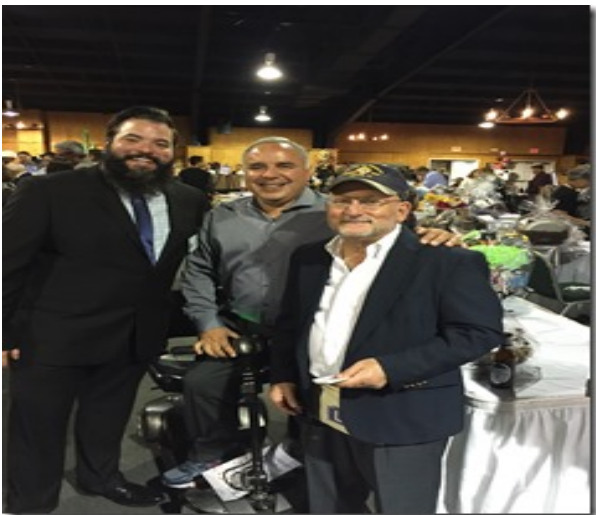
FIGURE 10 BROTHER KNIGHTS SUPPORTING CASINO NIGHTS EVENT