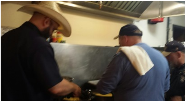
FIGURE 3 THE " MEAT & POTATOES OF TACO BREAKFAST