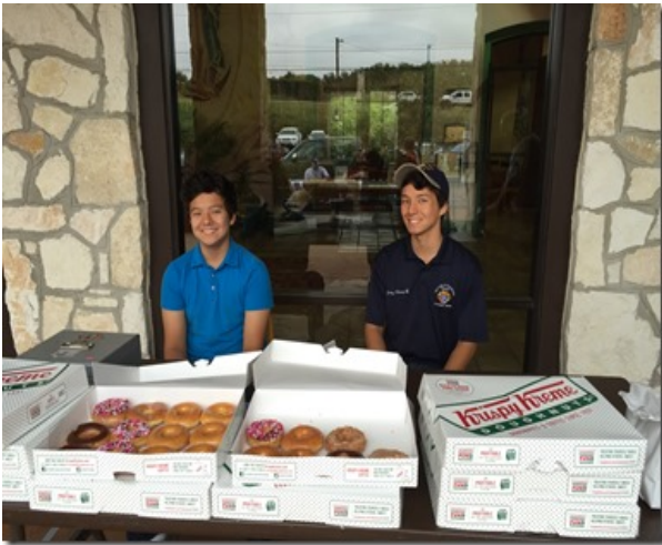
FIGURE 9 TWO "SHARP" GUYS WORK DONUTS DURING THE APRIL TACO DONUT SALE