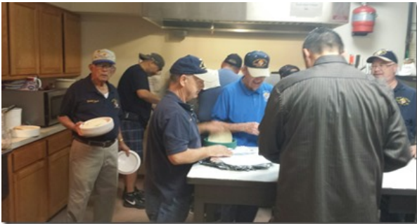
FIGURE 2 THE BACK BONE OF TACO BREAKFAST