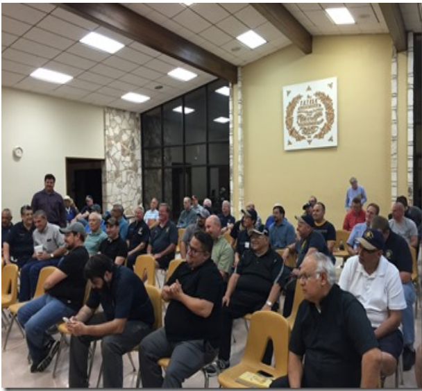
FIGURE 8 GREAT PARTICIPATION DURING THE APRIL COUNCIL MEETING