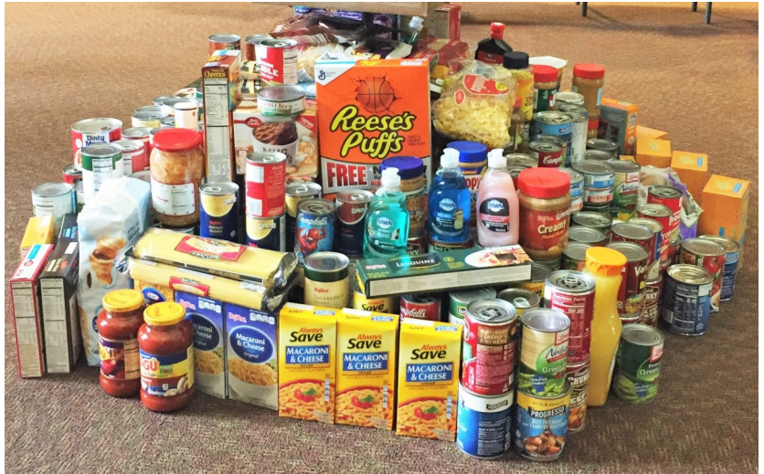
Supper Bowl 2019 St Francis Xavier Parish Food Collection

Lent is nearly upon us and once again we will participate in the 40 CANS FOR 40 DAYS PROGRAM . Last year our Council gave over 3000 pounds of food to this cause. Our goal this year is 4,000 pounds of food donations. Your individual help is critically needed. Consider that if 60 individual members of this council would each donate 40 cans of food during Lent, that would add about 2000 more pounds of food to our total Council donation and put us very close to 5000 pounds of food donated in a single year! During this Lenten season, when you go to the grocery store consider picking up some canned food goods that are on sale and bring them to church and put them into the House of Bread grocery basket located in Gaspar Hall. Then please call or email me how many items (or the poundage) you gave. Please help us by supporting this worthy charitable project. For every 1000 pounds of food our local Council donates we will get a $100 rebate from the Supreme Council. Cash donations are also very welcomed for this program. Just make your cash donations to Gordon Carmichael at one of our business meetings. Twenty dollars will buy 40 cans of food.