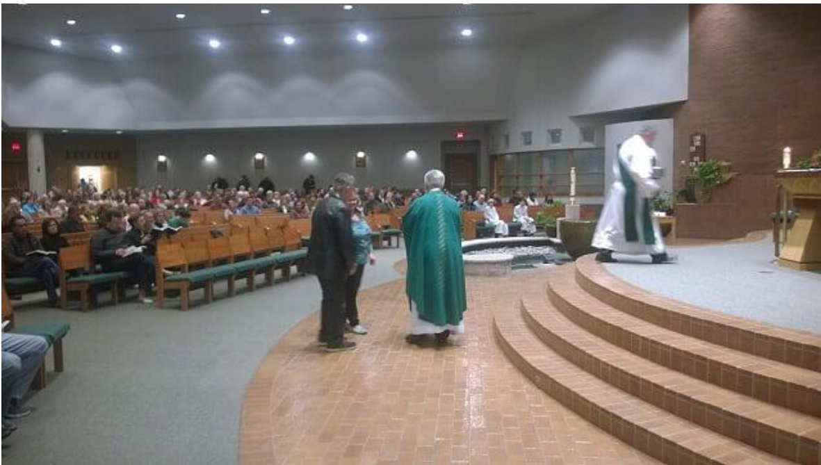
SK & Mrs scalia delivering the wine & bread at 5:00 mass, after rosary