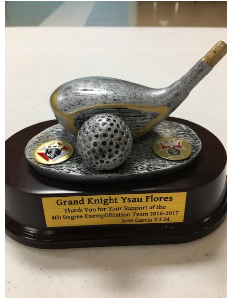
The “Appreciation Recognition” award for strongly supporting the 4 th Degree Exemplification Team