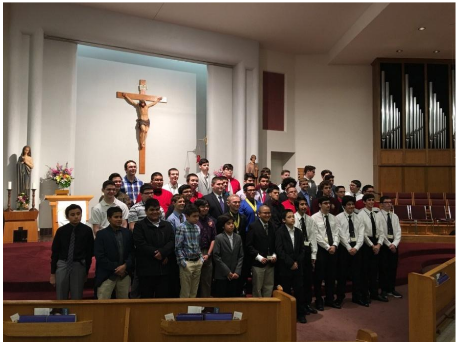
Squires at Mass at St Helena's Church