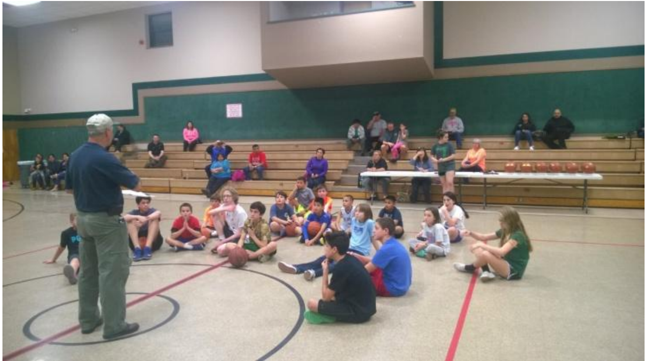
Reviewing Rules & Instructions Before the Competition