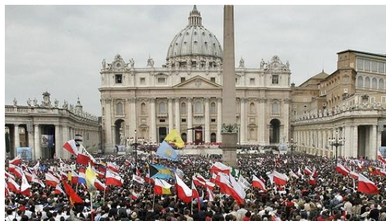
Canonization Mass at St Peter's

Find out more at www.kofcagency.com or by calling 1-855-4TN-KOFC