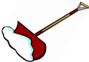
Brother Jim Pareigis works to break up the ice in the Cathedral alley after the winter ice storms.