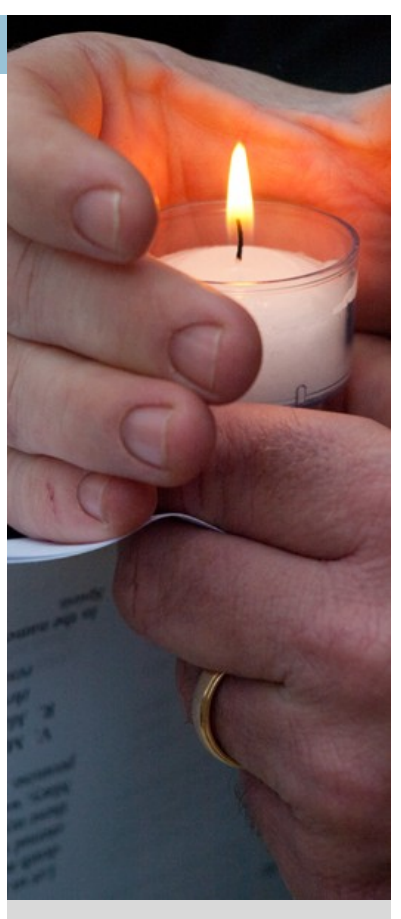
July / August, Issue 1