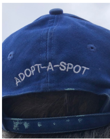
Four Knights braved the cold for our Adopt-A-Spot in March. Join us April 17, 8:30 AM . Free Coffee and Donuts afterward.