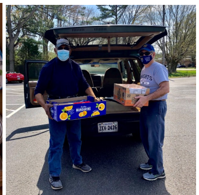
Food for Families Easter Food Drive exceeded our goal, netting 341 pounds of food for the VA. Peninsula Foodbank. The council donated 1136 pounds of food to the foodbank this year!