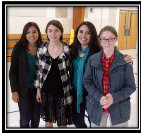
Meet the awesome foursome of OLA CYM who helped setup the hall and serve pancakes