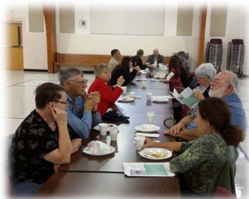
Thanks to all the parishioners who continue to support the pancake breakfast every month