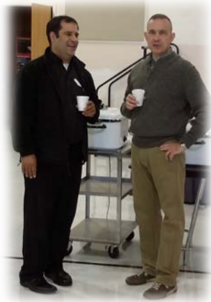
Time for sharing our faith