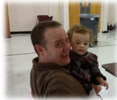
Meet the youngest parishioner at the October Pancake breakfast