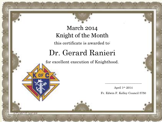
Past Knights of the Month