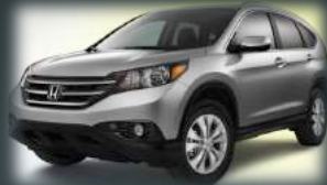
2014 Honda CRV