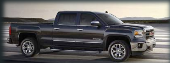
2014 GMC Sierra