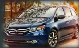
2014 Honda Odyssey