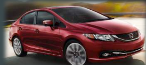
2014 Honda Civic