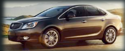
2014 Buick Verano