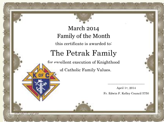
Past Families of the Month