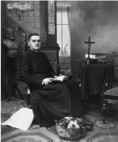
Father Michael J. McGivney – Our Orders Founder

As we ended the Easter season with the Feast of the Pentecost, let us be receptive to the workings of the Holy Spirit. "...Renew in me a steadfast Spirit."