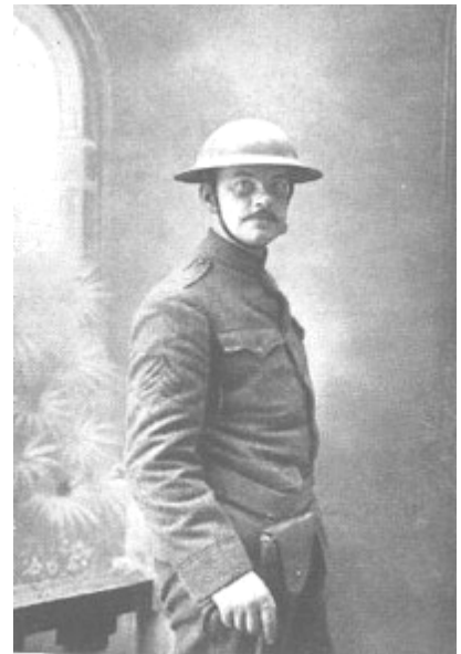
Joyce Kilmer in his WWI uniform

A famous World War I veteran who died while fighting for the “Fighting 69th. He left a legacy of a wife and five children at the time. In the wake of his passing, his literary talent in poetry touched many hearts with his gentle evangelization for the Catholic faith which he embraced when his young daughter was struck with infantile paralysis. The graces bestowed on he and his wife during those family sufferings led them to convert to Catholicism. (From the Columbian, June 2019)*