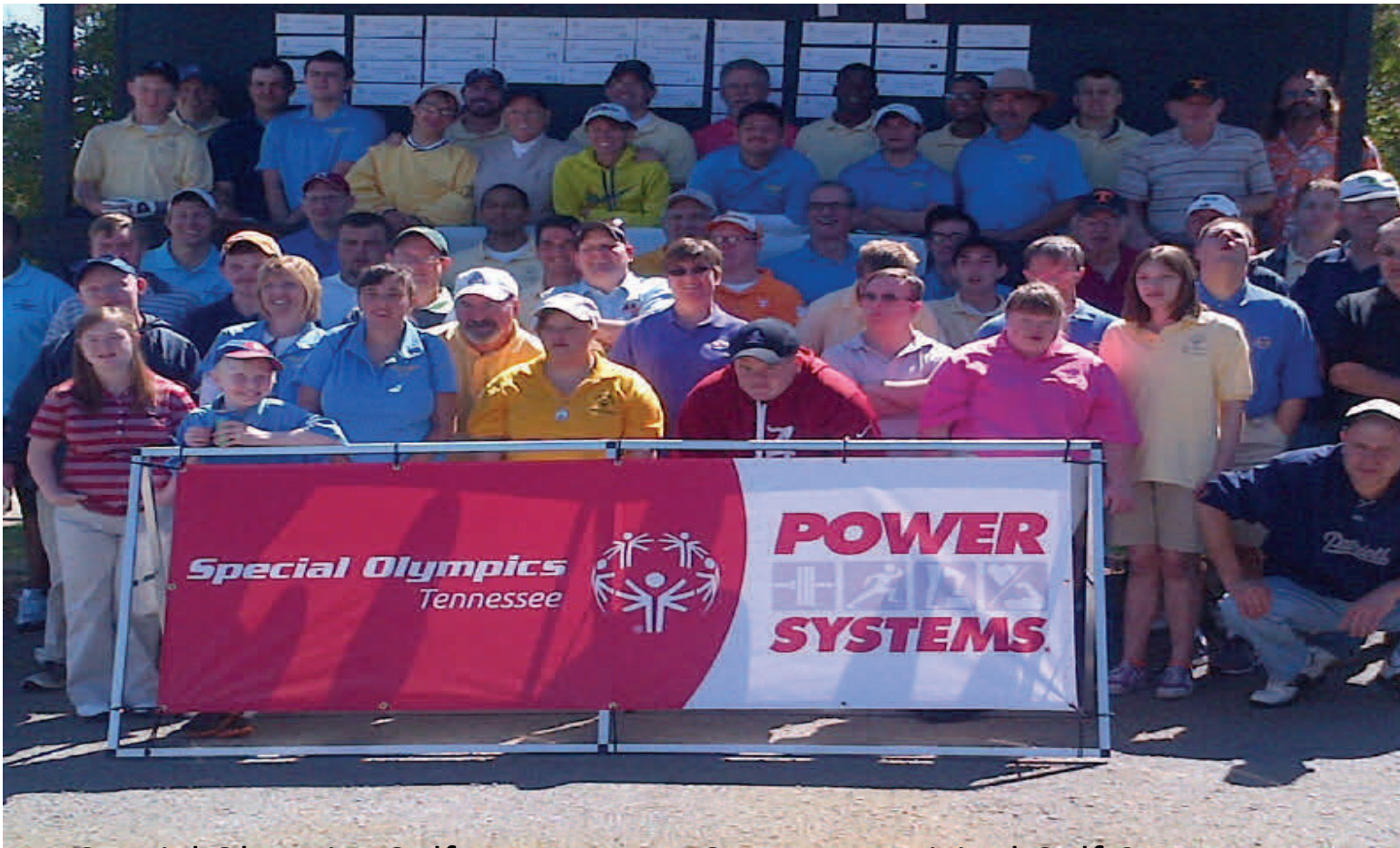
Special Olympics Golf Tournament, Smyrna Municipal Golf Course.