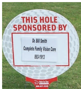
Golf Tournament Sign Sponsors.