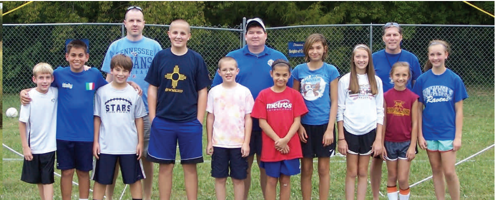
KNIGHTS SOCCER CHALLENGE. PLAYERS AND KNIGHT VOLUNTEERS.