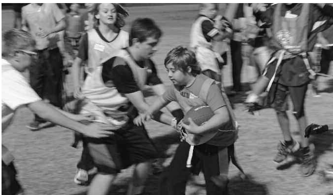
Aside from meeting the professional football players, the Special Olympic athletes also participated in a flag football game.