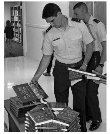
Following the charter presentation, council members examine copies of books printed by the Knights of Columbus, including the supreme knight's bestselling book A Civilization of Love.

In addition to the charter presentation and Mass celebrated at Our Lady of Loreto Chapel on the base, the supreme knight and the other guests also toured and attended Mass at the Basilica of St. Michael the Archangel, visited the National Naval Aviation Museum and met with Bishop Gregory Parkes.