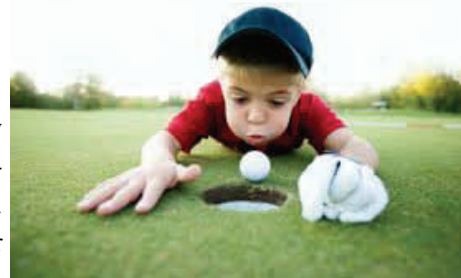
Working for Dad!

Council members will report at 7 a.m. Saturday, July 4 to raise flags over Calvary Cemetery and return at 4 p.m. to take them down till the next patriotic holiday. Come join us, first, for coffee and pastries, then for our patriotic display in celebration of our country's independence.