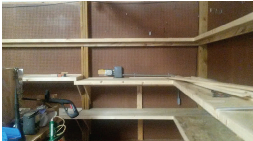
This new shelving offers additional space for sale items in Spirit Hall, including art work and games/toys.

some additional lightning is roughly $650. As of February 2, the concrete work for the foundation was finished.