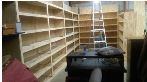
This Reiter Hall shelving has taken the space belonging to the check-out desk, lighting fixtures, etc.