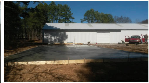
The foundation is ready. And away we go! Too late for initials.