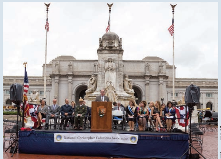
On Columbus Day, Oct. 9, Fourth Degree Knights from Virginia, Maryland, the District of Columbia and surrounding areas honored Christopher Columbus at a wreath-laying ceremony held in Washington, D.C. The event took place at the explorer's memorial fountain, which was dedicated in 1908 and established in great part through the efforts of the Knights of Columbus.

Gene Kranz, longtime NASA flight director and leader of the mission control team that saved the crew of Apollo 13, was one of the many people whose home was severely damaged by Hurricane Harvey. In a new video on the Supreme Council's YouTube channel, www.youtube.com/knightsofcolumbus , Kranz describes how the Knights delivered aid and inspiration to the hurricane victims. Every Knight should watch this video and consider using it at his council's next recruitment event, as it speaks so accurately about what it means to be a Knight of Columbus.