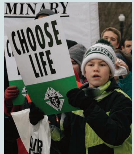
Spirit Juice Studios