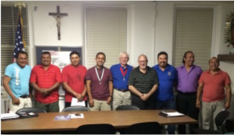
Council 15707 Lexington