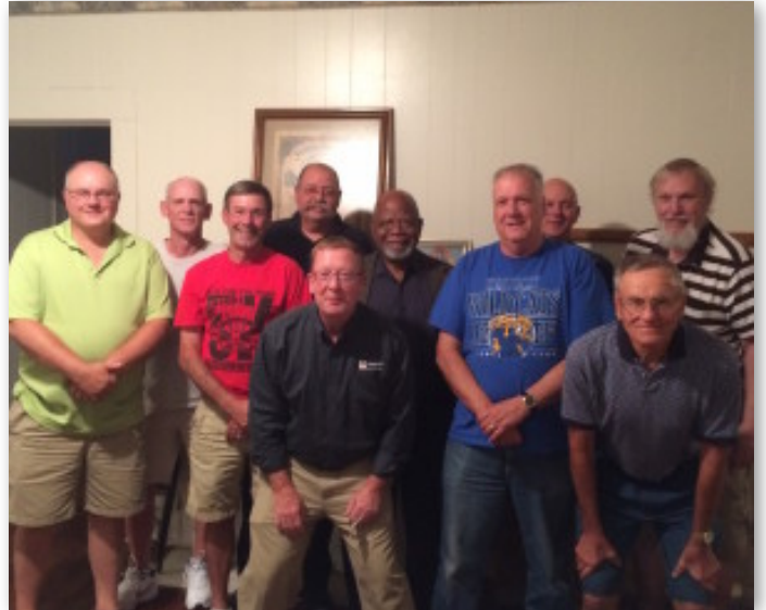
Council 1487 Ashland