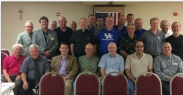
Council 14130 Lexington