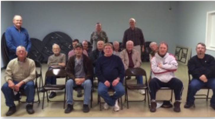
Council 6897 Murray