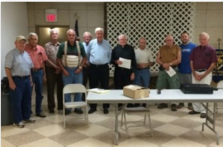
Council 6101 Owensboro