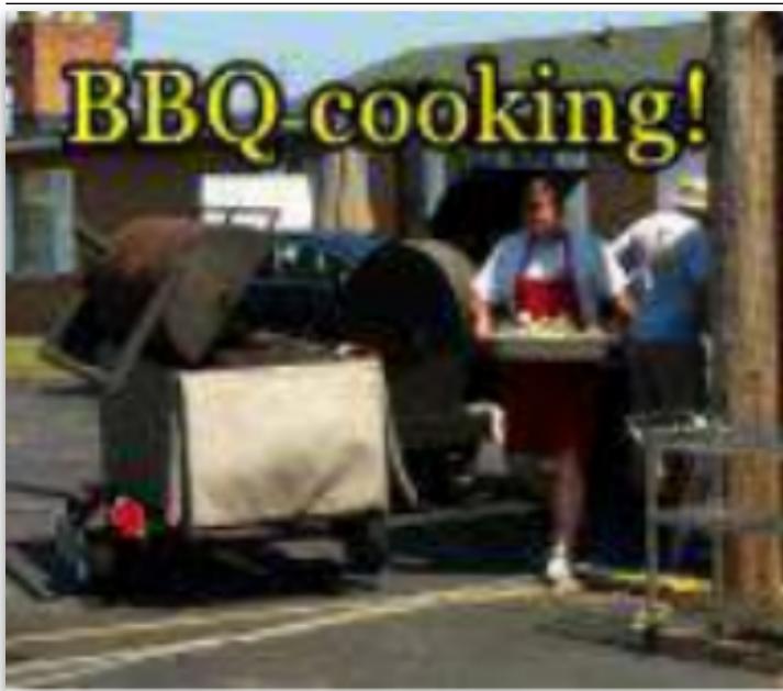
Council 1487 in Ashland provided the meat and cooking for the council picnic held in August.