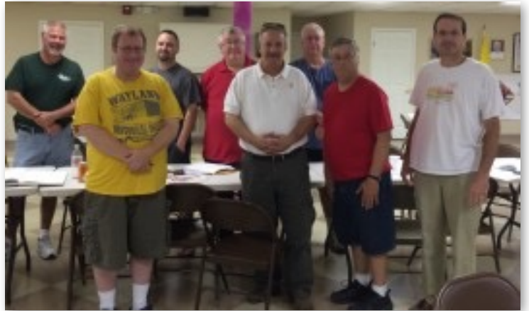
Council 15681 Lawrenceburg