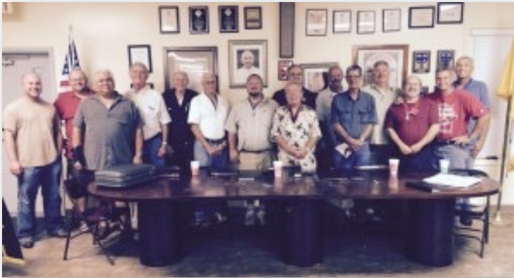
Council 14234 Taylorsville