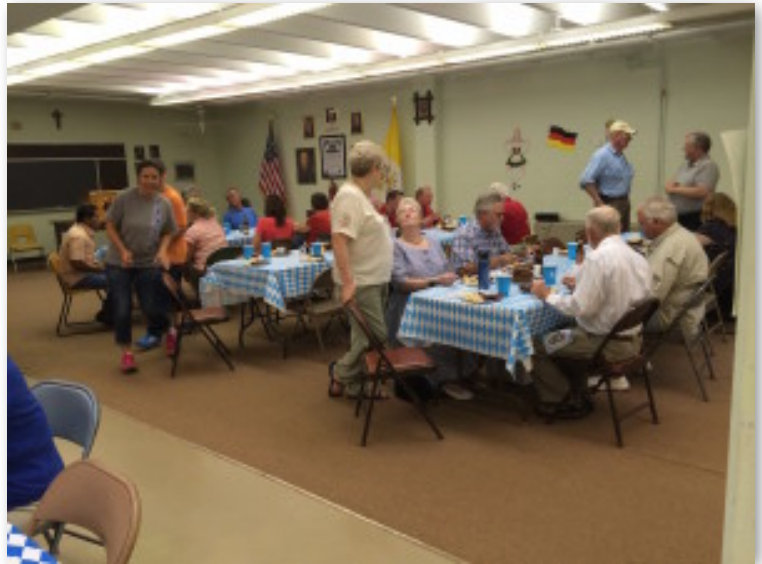
Council Council 15181