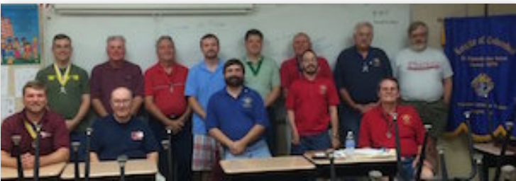
Council 12774 Lexington