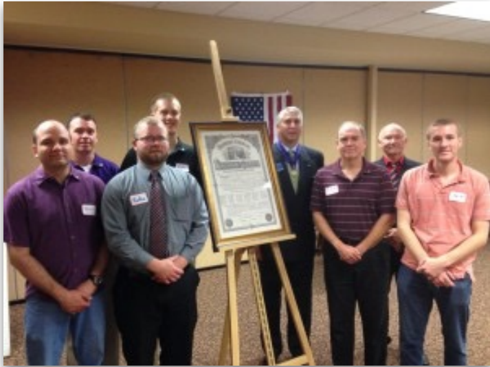
Council 14130 Christ the King in Lexington hosted a 1st degree exemplification on Sunday August 30th. During the degree council 14130 brought in six new brother knights and council 15452 brought in one new brother knight.