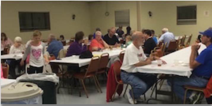
Kehoe Council 1764 held their first Friday Fish Fry of the season on November 6th.