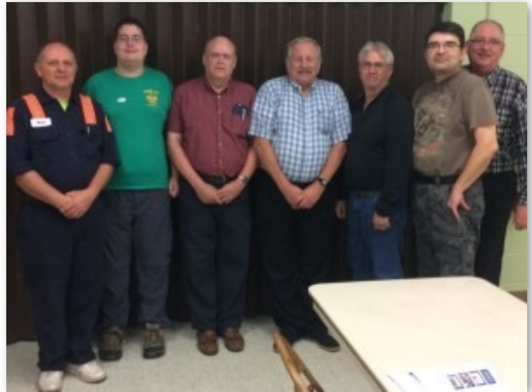
Council 8145 Russellville