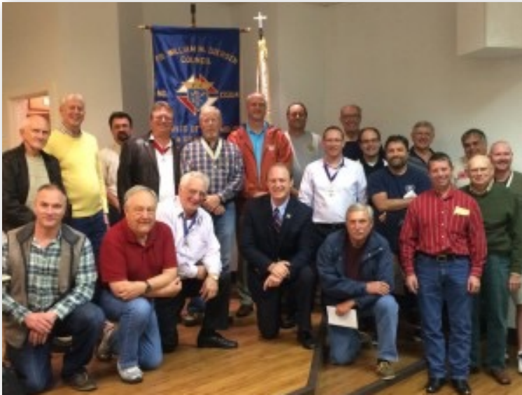
Council 13304 La Grange