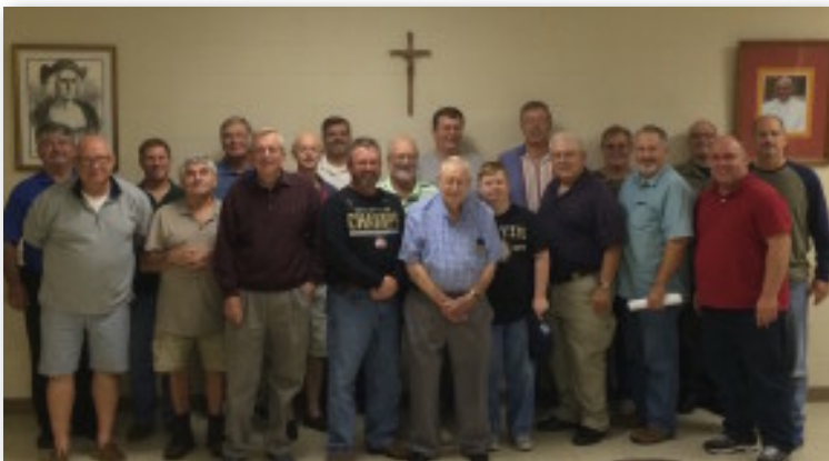
Council 1455 Elizabethtown