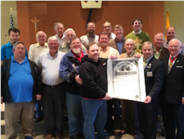
Council 16232 Scottsville