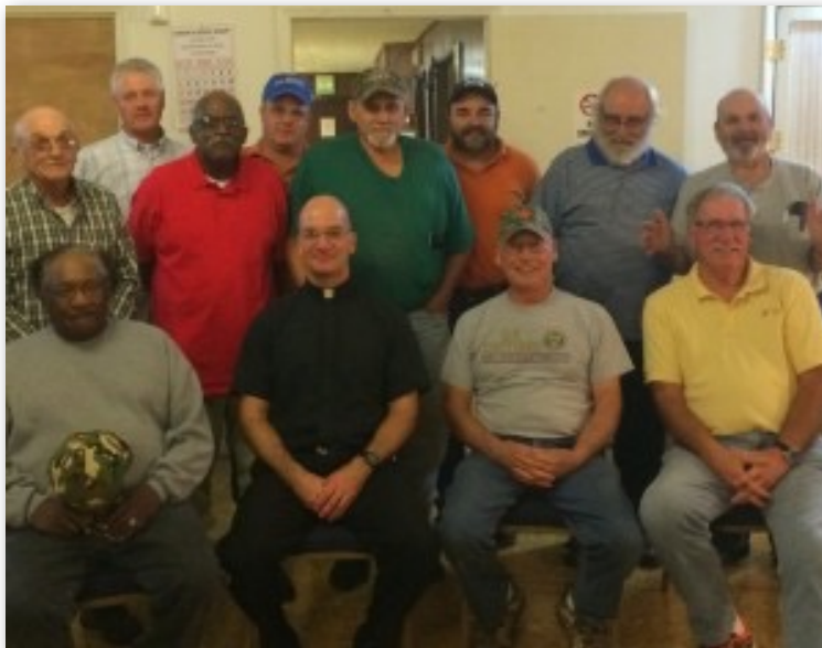
Council 1367 in Uniontown