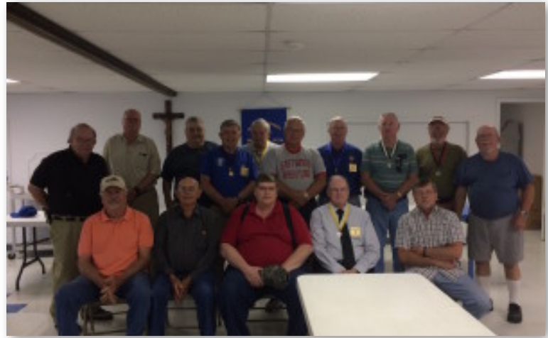
Council 12354 Mt. Washington